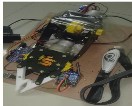
Fig 3.1 Result